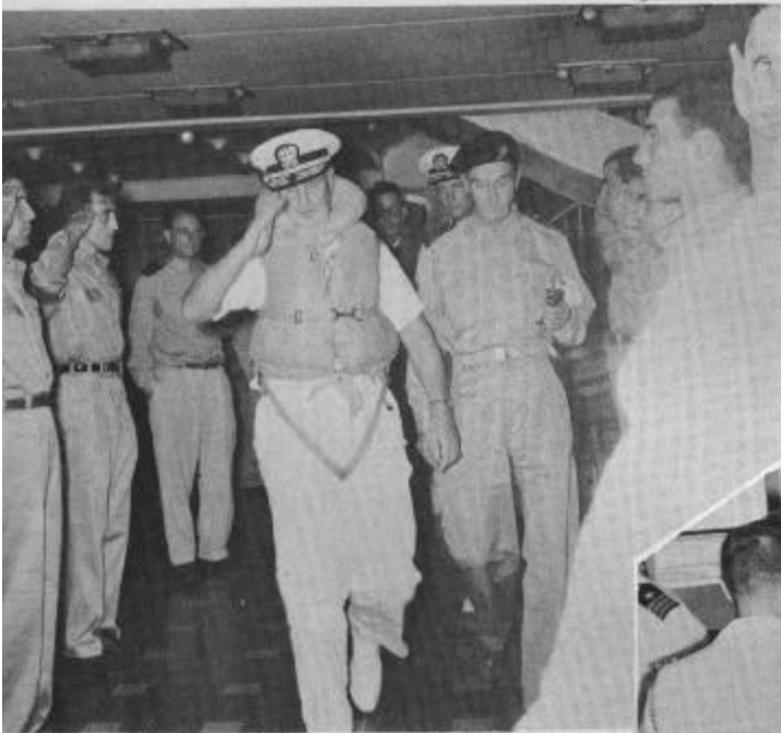
Now muster the duty side boys