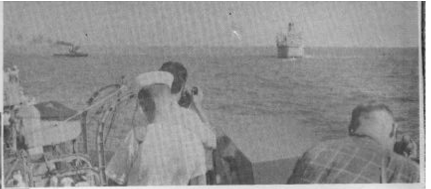
Thar she blows