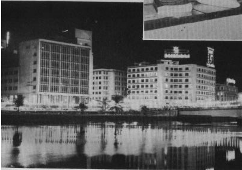
Recife at night—in case you didn't get outdoors