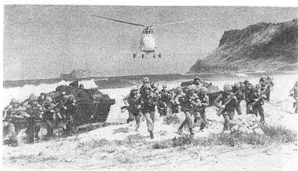
Marine infantrymen storm ashore during an amphibious exercise.