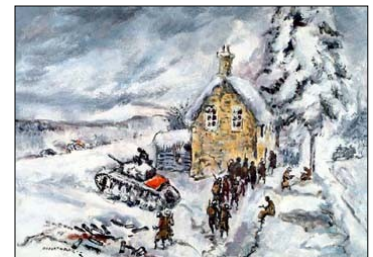
Breakfast in the Snow

"That evening's Christmas vigil began badly, with two bombing raids, compliments of the German Luftwaffe. Still, religious services were held in town where wounded Airborne soldiers shed tears at the singing of "Silent Night" and German POWs were visited by Gen. McCauliffe himself, as they sang "Stille Nacht" and "O Tannenbaum."